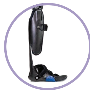
Optional coronal correction for increased control