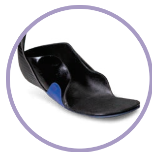
Molded inner boot comes as standard to ensure optimal triplanar control