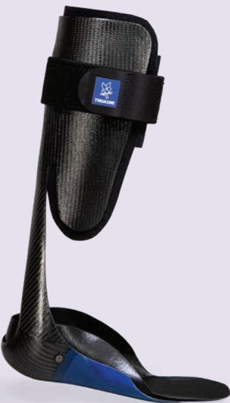
Posterior Shell & Coronal Correction