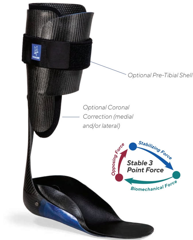
Pre-Tibial Shell & Coronal Correction