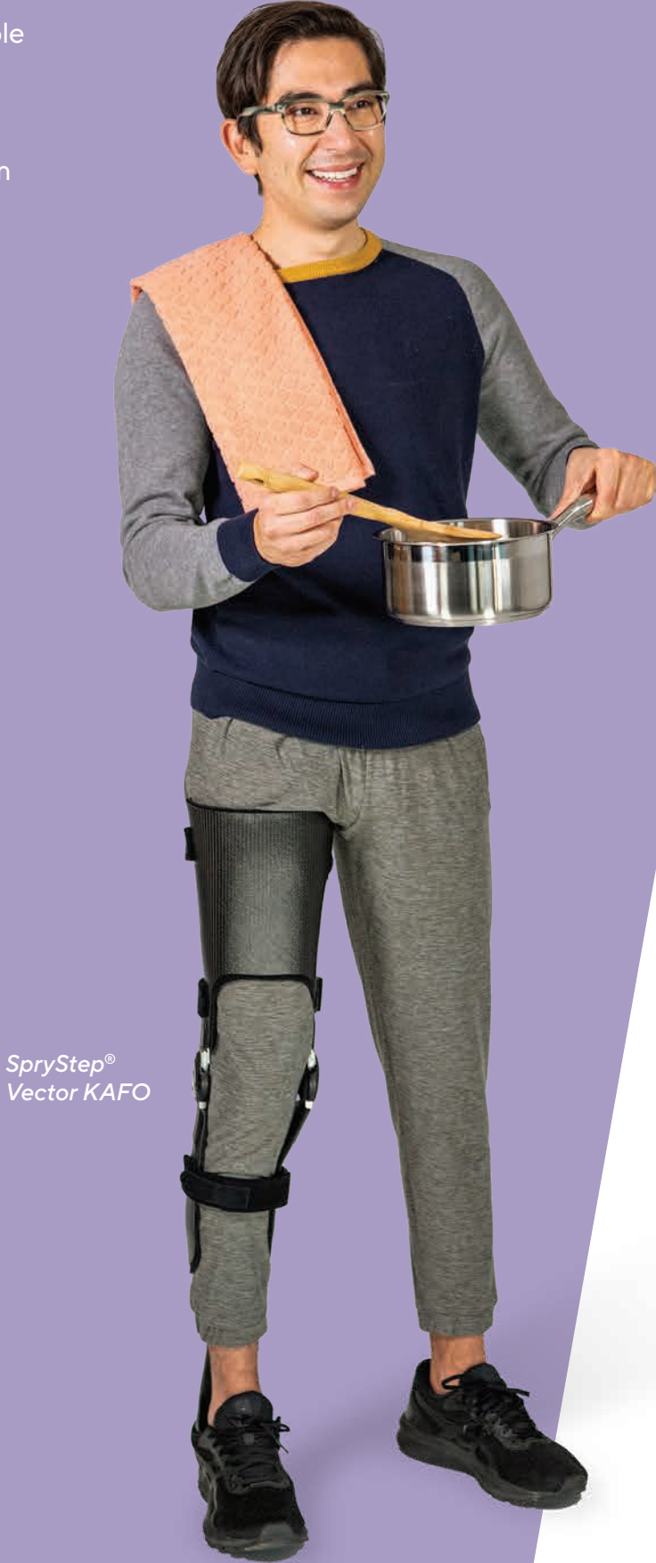
SpryStep® Vector KAFO

From the elegant yet durable range of SpryStep AFOs, to custom knee braces and specialty KAFOs, Thuasne USA offers effective custom solutions for the most complex patients.