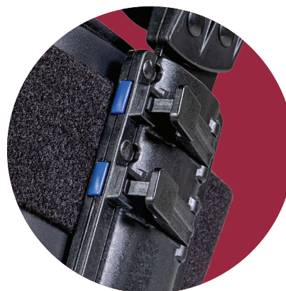
Button Control Length Adjustment