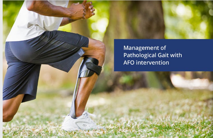
Management of Pathological Gait with AFO intervention