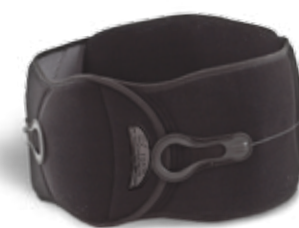
SLEEQ AP L0627/L0642 Low-profile sagittal (anterior-posterior) control lumbar orthosis Part # 901100