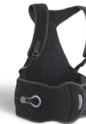
SLEEQ FLEX L0456/L0457 Flexible sagittal (anterior-posterior) control thoraco-lumbo-sacral orthosis Part # 901400