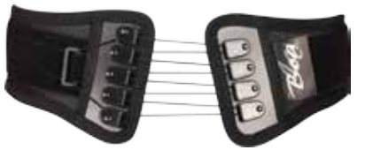
BOA SI L0621 Ultra low profile support for the sacro-iliac joint available in three sizes Part # 51024-X

BOA braces provide excellent semi-rigid support via mechanical advantage pulley systems and medical grade plastics in well proven traditional brace designs.