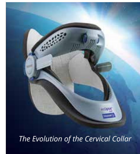
The Evolution of the Cervical Collar