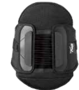
BOA Slim Panel XTR L0631/L0648 Semi-rigid anterior-posterior control Part # 51023-X