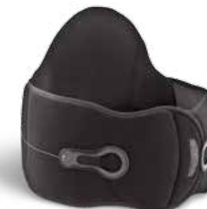
SLEEQ AP+ L0631/L0648 Enhanced profile sagittal (anterior-posterior) control lumbo-sacral orthosis Part # 901200