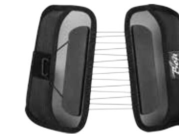
BOA LP 8" L0627/L0642 Low profile anterior-posterior control Part # 51010-X