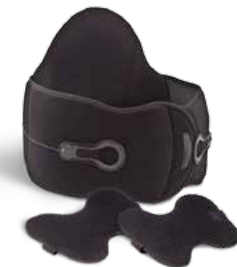
SLEEQ APL L0637/L0650 Enhanced profile sagittal-coronal (anterior-posterior-lateral) control lumbo-sacral orthosis Part # 901300