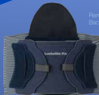
Removable Rigid Back Panel